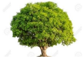
c) Mango tree

7. Identify the creeper and put a tick (✓) on the picture which are given below: