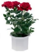
a) China rose

5. Identify the herbs and put a tick (✓) on the picture which are given below: