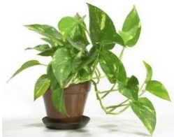
a) Money plant

7. Identify the creeper and put a tick (✓) on the picture which are given below: